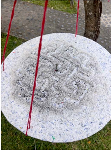
Maze drawing. Sea salt and a little beach sand