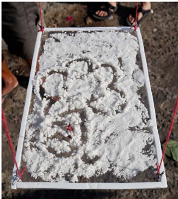
Chicken drawing. Sticky humid sea salt