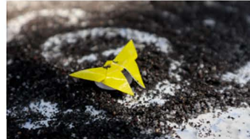
moth avatar. Yellow paper, lacquer and 10 by 2 mm magnet