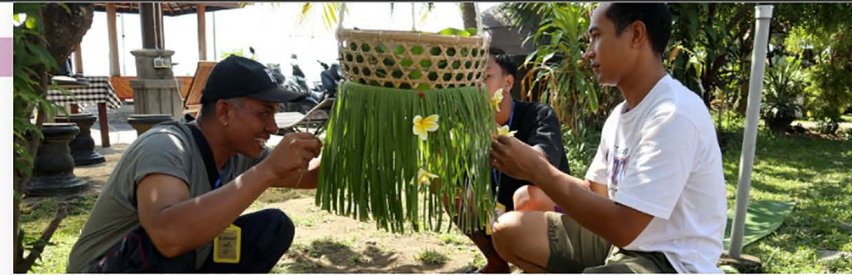
Decoration issues. Palmleaf and baskets look too much like offerings in the night. Banana leaf made a good decoration.